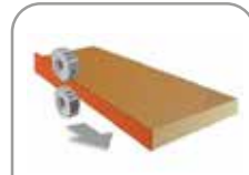
ALT ÜST FREZE BOTTOM & TOP MILLING