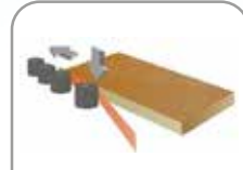
BASKI GRUBU PRESS UNIT