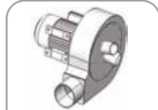
TOZ EMME ÜNİTESİ DUST SUCTION