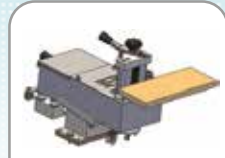
TUTKAL KAZANI GLUE UNIT