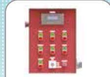
KUMANDA PANELİ CONTROL PANEL