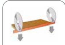
BAŞ SON KESME END MILLING