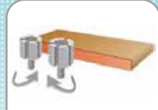
ÖN FREZE PRE - MILLING