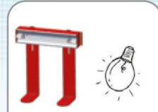
İNFRARED ISITICI INFRARED HEATING