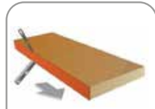
R2 KAZIMA R2 SCRAPING