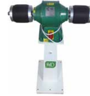
ÇİFTLİ BALON ZIMPARA DOUBLE BALOON MACHINE