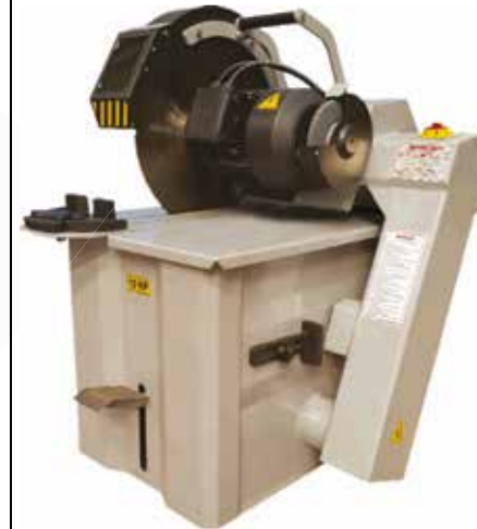
TRANJER TESTERE SAW FOR PROFILE