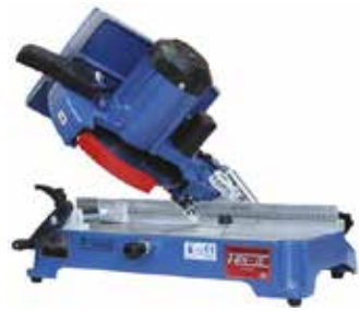
GÖNYE KESME PORTABLE CUTTING MACHINE