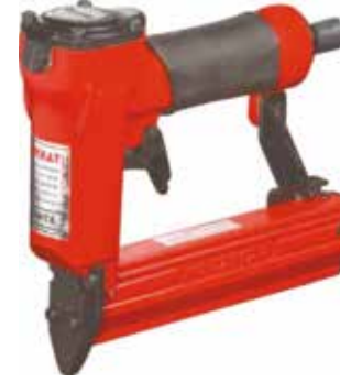
ÇİVİ ÇAKMA TABANCASI PNEUMATIC STAPLER