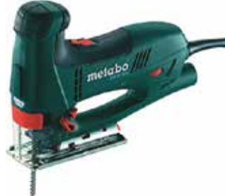
DEKUPAJ TESTERE JIGSAW