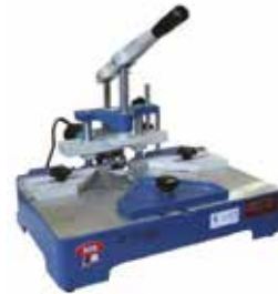
KÖŞE BİRLEŞTİRME CORNER ASSEMBLING MACHINE