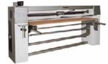
BANT ZİMPARA BAND GRINDING MACHINE