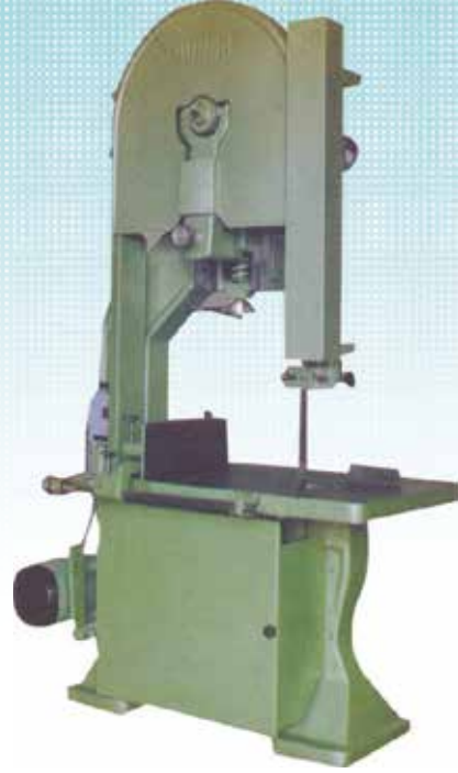
ŞERİT MAKİNASI / BAND SAW MACHINE 40 - 50 - 60 - 70 - 80 - 100

DİĞER MAKİNALAR VE EL ALETLERİ OTHER MACHINES AND HAND TOOLS