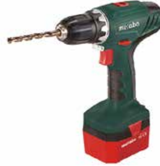
AKÜLÜ VİDALAMA CORDLESS DRILL