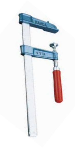
İŞKENCE CARPENTERS CLAMP