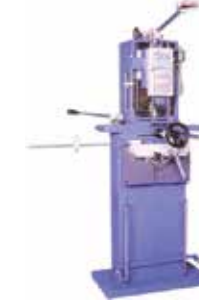
ZİNCİRLİ MATKAP DRILLING MACHINE WITH CHAIN