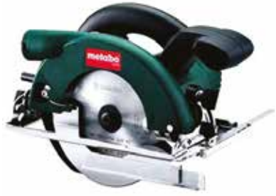
DAİRESEL TESTERE CIRCULAR SAW