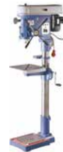
SÜTUN MATKAP DRILLING MACHINE