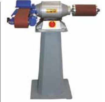
BALON BANT ZIMPARA GRINDING - BALOON MACHINE