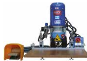
TAS MENTEŞE YERİ AÇMA HINGE SLOT MACHINE