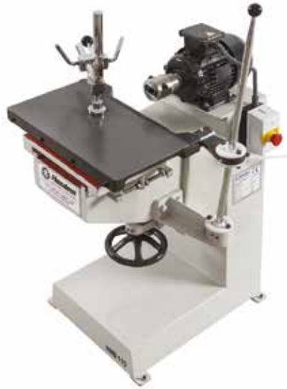
YATAY DELİK MAKİNASI HORIZONTAL BORING MACHINE