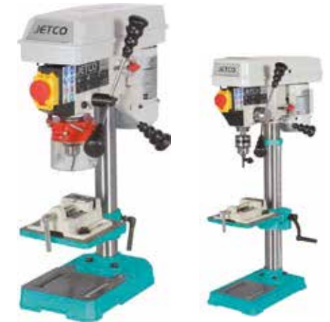
MASA ÜSTÜ MATKAP DRILLING MACHINE