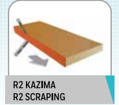
R2 KAZIMA R2 SCRAPING