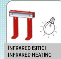
İNFRARED ISITICI INFRARED HEATING