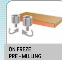
ÖN FREZE PRE - MILLING