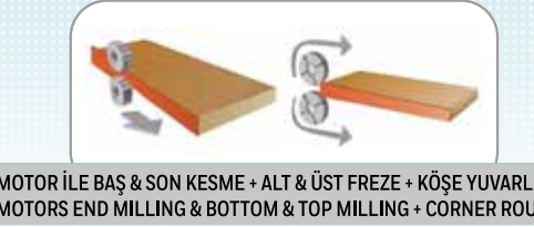
3 MOTOR İLE BAŞ & SON KESME + ALT & ÜST FREZE + KÖŞE YUVARLAMA 3 MOTORS END MILLING & BOTTOM & TOP MILLING + CORNER ROUNDING