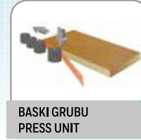
BASKI GRUBU PRESS UNIT