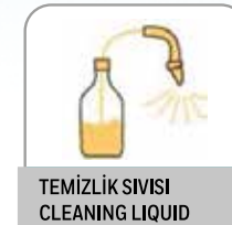
TEMİZLİK SIVISI CLEANING LIQUID