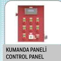
KUMANDA PANELİ CONTROL PANEL