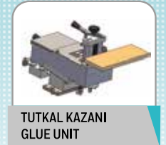
TUTKAL KAZANI GLUE UNIT