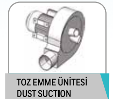
TOZ EMME ÜNİTESİ DUST SUCTION